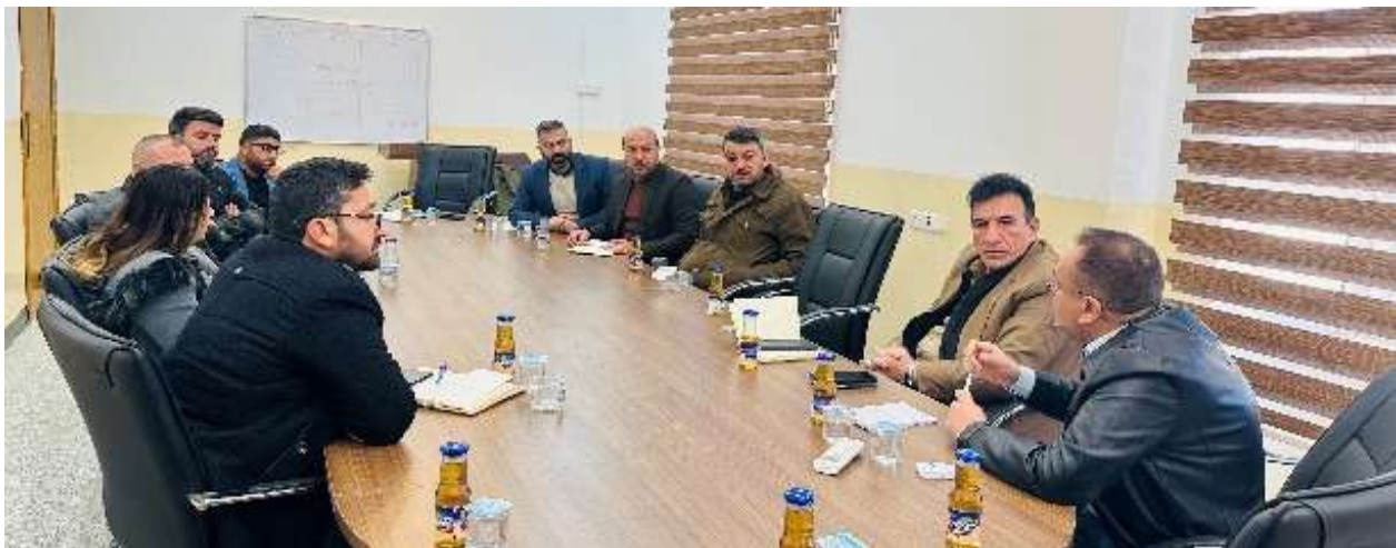
Figure 1 discussions during the session

During the November community dialogue, the families expressed their intention to return to their area of origin, but they emphasized that such a return is only possible with support from local authorities and humanitarian organizations. Acknowledging the severe conditions in the area, they stressed the importance of immediate assistance to address critical infrastructure needs. Given these ongoing challenges, the thematic meeting was scheduled for February 2025, to further explore the situation and discuss potential solutions. The meeting focused on infrastructure rehabilitation and access to basic services. Additionally, the meeting sought to develop an actionable plan for rubble removal, service restoration, and return facilitation, while also strengthening collaboration between community members, local authorities, and NGOs to enhance coordination efforts in addressing the needs of returnees.